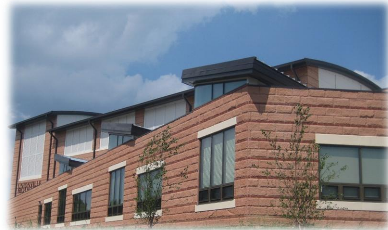
Figure 1: Unionville High School

Located at 750 Unionville Road in Kennett Square Pennsylvania, the Unionville High School Additions and Renovations project consists of new construction as well as the demolition and renovation of existing spaces. With a total size of 319,000 square feet and 3 stories, the new building is set to house not only Unionville High School but also the Unionville-Chadds Ford School District Administrative Office (Figure 1). Unionville-Chadds Ford School District, MM Architects, Inc., and Wohlsen Construction have teamed up to complete this large educational project.